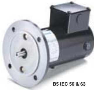
B5 IEC 56 & 63

A terminal board is provided for connections. All fasteners are metric. Electrical and mechanical features are the same as listed for the NEMA frame motors on the opposite page. Tachometer mounting kits are available—please contact LEESON for data.