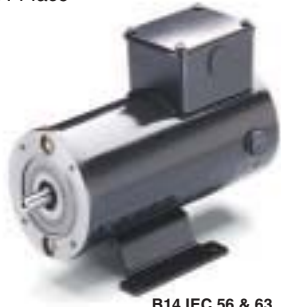
B14 IEC 56 & 63