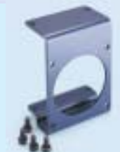
Output Flange Mount Kit